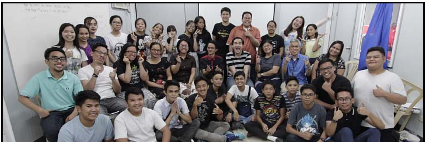
VBS2018 teachers and helpers pose for picture as they get ready for the annual event happening from May 28 to June 1 with the theme, Jerusalem: Back to the Holy Land.