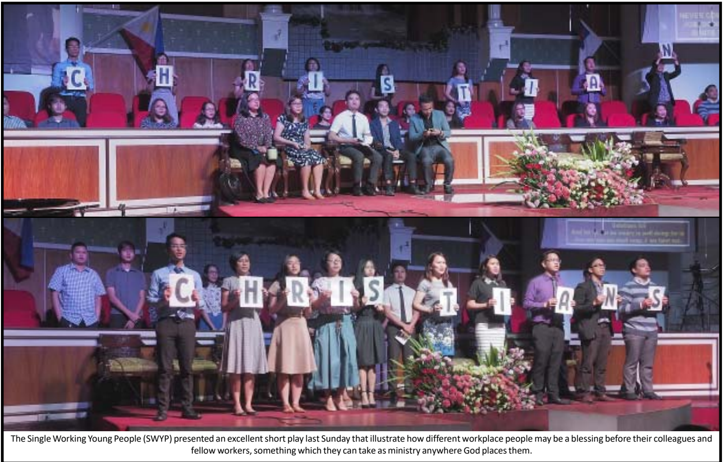
The Single Working Young People (SWYP) presented an excellent short play last Sunday that illustrate how different workplace people may be a blessing before their colleagues and fellow workers, something which they can take as ministry anywhere God places them.

"Unto Him be glory in the church by Christ Jesus throughout all ages, world without end. Amen" (Eph. 3:21)