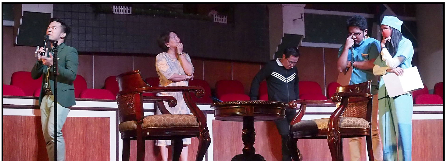
The Lighthouse District 4 members presented a unique scene in a mental facility to represent the many characters of Christians in the Ekklesia.

FIRSTFRUITS 2016 COUNTDOWN Eight (8) Weeks.