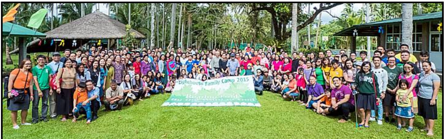
The more than 200 of Lighthouse BBC members who joined the Lighthouse Family Camp at the Rizal Re-Creation Center in Rizal, Laguna pose for a picture immediately after the challenge last Wednesday morning. Plans are being made to hold the 2016 camp at the same place, the Lord willing.

First Quarter Focus : "Proving the sincerity of our love."