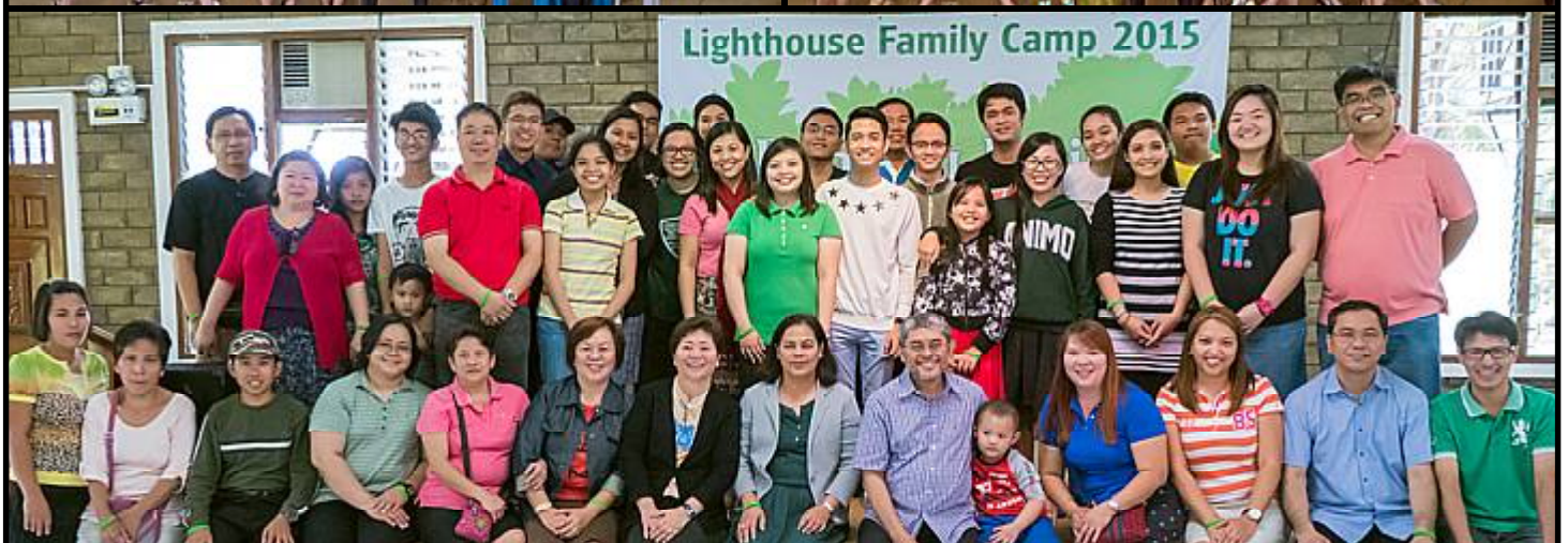
Above pictures from top, mid-left, right and bottom: The Red Team (3rd Runner-up), the Orange Team (2nd Runner-up), the Yellow Team (1st Runner-up), then, the Lighthouse Family Camp 2015 Champion, the Green Team). For the Bible Quiz, the Green Team took the Championship post, then Orange Team (1st Runner-up), then Yellow Team (2nd Runner-up) and Red Team (3rd Runner-up). The camp theme was, Bearing Fruit By God's Word.

"Unto Him be glory in the church by Christ Jesus throughout all ages, world without end. Amen" (Eph. 3:21)