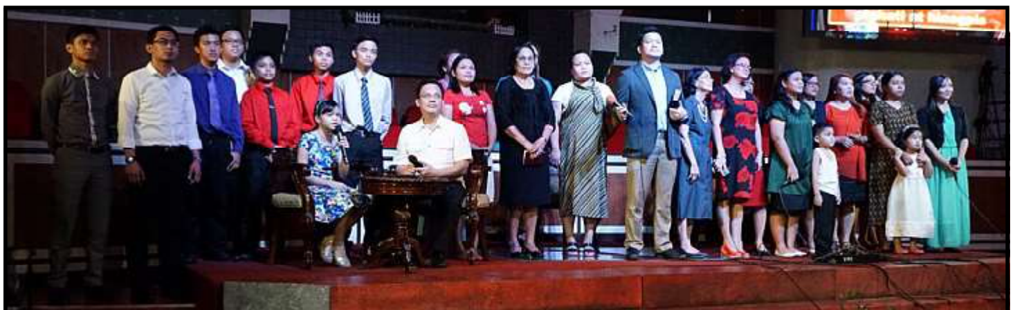
The Lighthouse District 1 dramatized how commitments of believers should be fulfilled regardless of circumstances in life.

Chapter 13 of Paul's epistle to the Romans lays down additional principles which can serve as