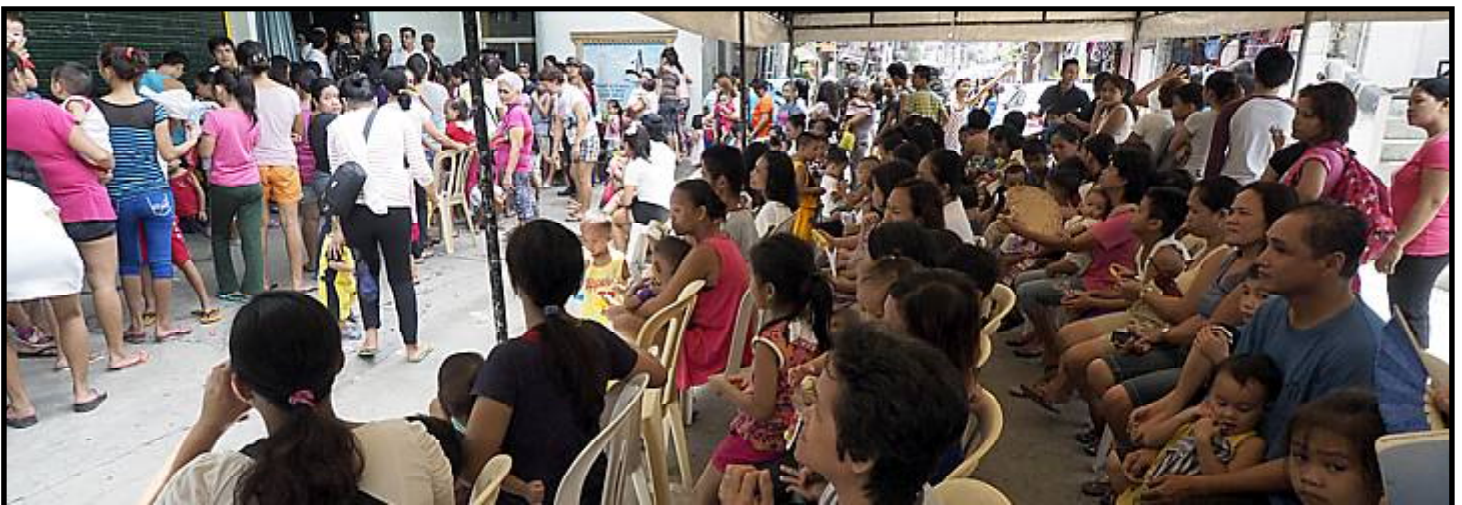
Hundreds of residents from Tatalon and nearby barangays wait for their turn to receive medical attention in yesterday's Medical Mission.

The Apostle Paul refers to the actual performance of giving as an "expedient" thing, meaning, something better, good and profitable. He practically says the actual giving of something committed is a "profitable" performance. Indeed it is! Come then on Sunday, ready in heart and mind give our Firstfruits!