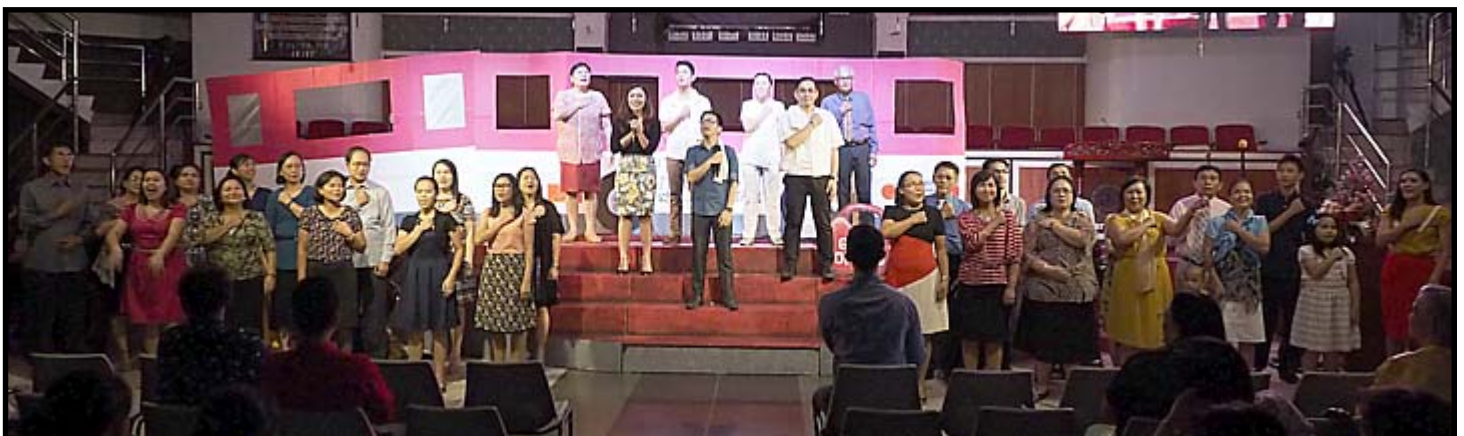
The Lighthouse District 5 present their Step of Faith Commitment Bus drama last Sunday. The Commitment Bus will be on display at the Lobby 2.

NOTICE THAT OUR NEW OFFERING ENVELOPES INCLUDE DESIGNATED OFFERINGS FOR THE LIGHTHOUSE STEP OF FAITH. BE INVOLVED IN THIS PROJECT FAITHFULLY AND REGULARLY.