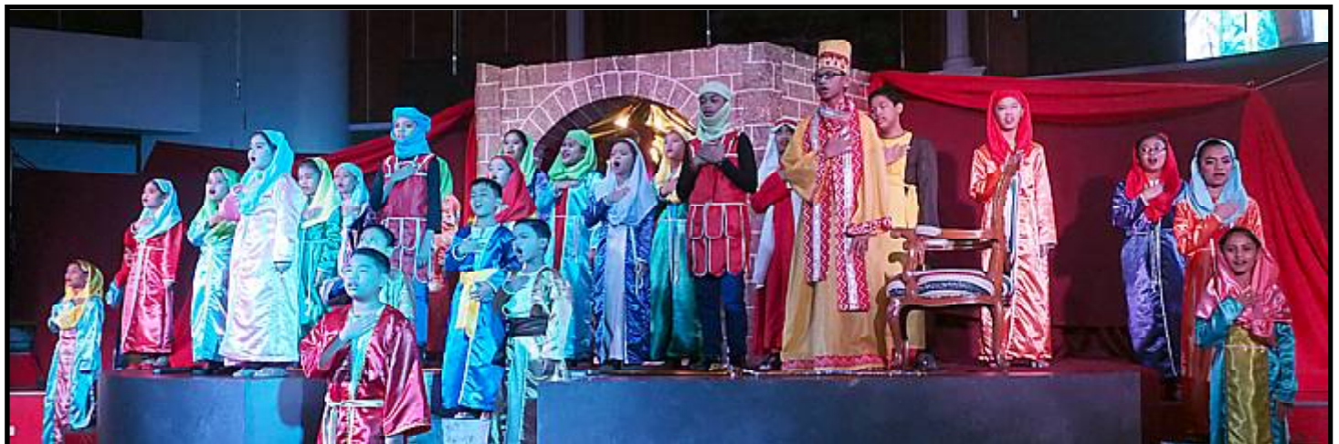
The Lighthouse Academy students as they perform the musical play, "It's Cool in the Furnace," based on the story of the Daniel and his friends.

As God graciously extended to us this blessing, let us then be more than willing to sacrifice and raise the needed P9M funds to cover for the equity and transfer expenses for the loan package. Let us be willing even beyond our usual ability to give and offer our acceptable sacrifice. -PRA