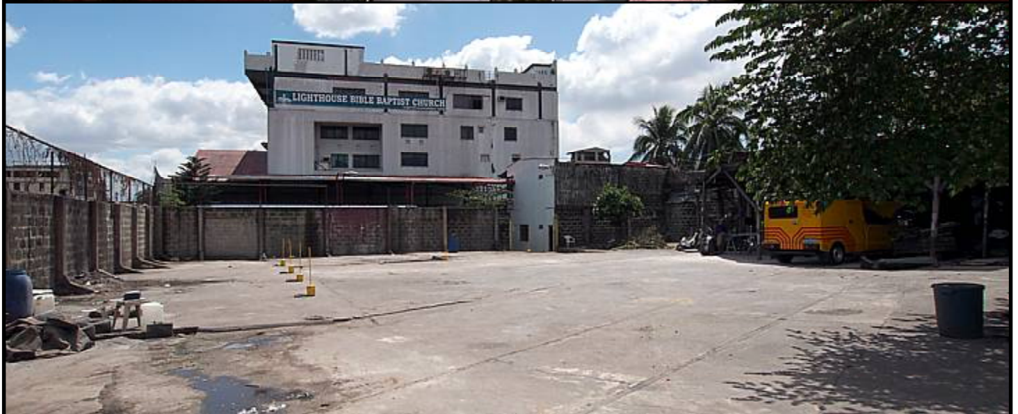
Top photo, the Lighthouse District 5 as they present the practical aspects of the fruit of the Spirit as found in Gal 5:22. Lower photo shows the newly acquired property after it has been cleared of the stalls. Ground breaking of the new property will be on the Anniversary Sunday, March 22.

"Unto Him be glory in the church by Christ Jesus throughout all ages, world without end. Amen" (Eph. 3:21)