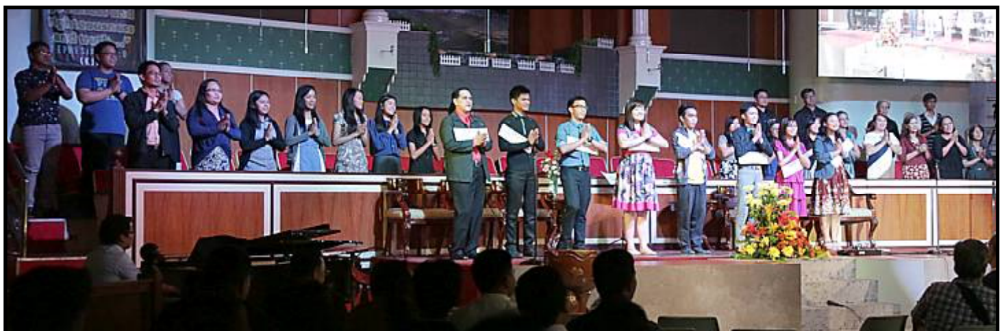
The Lighthouse District 1 initiates the weekly fellowship presentation with one that centers on the Fruit of the Spirit.

EIGHT (8) WEEKS REMAIN UNTIL OUR 39th ANNIVERSARY CELEBRATION AND SACRIFICIAL GIVING SUNDAY. LET US ALL PRAYERFULLY PREPARE.