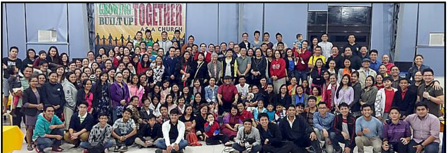
The happy faces in this picture show how the Lighthouse Family Camp thrilled everyone. Begin to set your eyes on December 28-30, 2015!

Congratulations to all color teams, especially to the Red Team which won the over-all championship award!