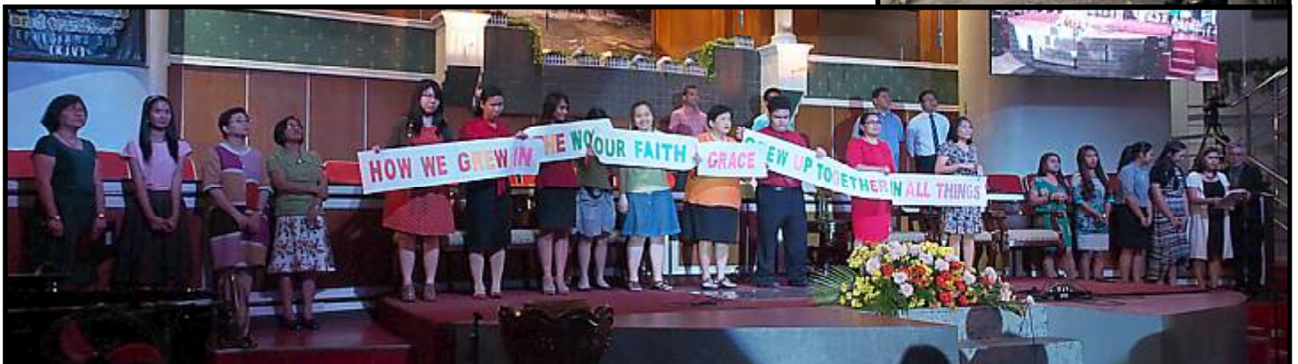
The Lighthouse District 2 presents a measurement of our growth based on the theme and focuses last year.