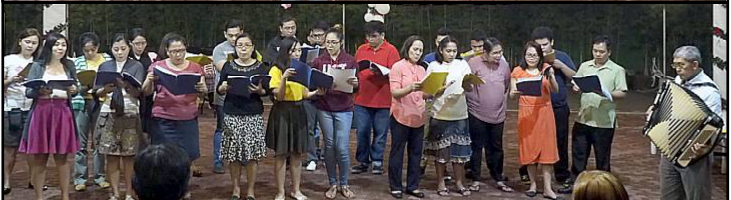
Three events were held at the Lighthouse Events Place last Friday. In the morning, the Lighthouse Academy held their Christmas Party (top photo). The children and parents who benefit from the Gabay Nutrisyon Feeding Program then held their Christmas Party in the afternoon (middle photo). In the evening, it was the turn of the Lighthouse District 6 to come and hold their party and be encouraged by the carolers (bottom photo).

"Unto Him be glory in the church by Christ Jesus throughout all ages, world without end. Amen" (Eph. 3:21)