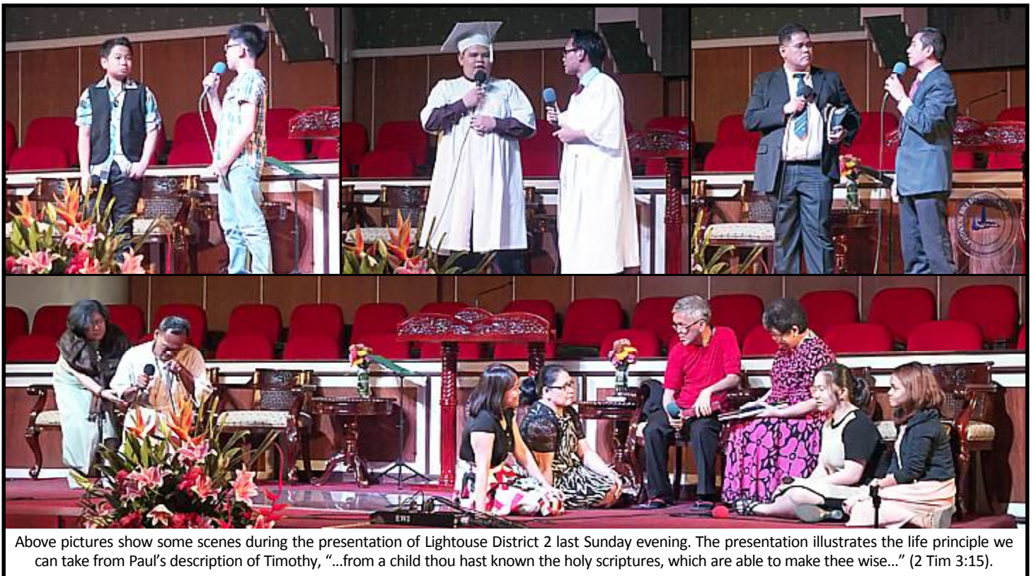
Above pictures show some scenes during the presentation of Lighthouse District 2 last Sunday evening. The presentation illustrates the life principle we can take from Paul's description of Timothy, "...from a child thou hast known the holy scriptures, which are able to make thee wise..." (2 Tim 3:15).

"Unto Him be glory in the church by Christ Jesus throughout all ages, world without end. Amen" (Eph. 3:21)