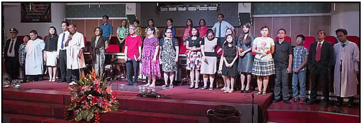
The Lighthouse District 2 members present an excellent example of how the things of God should be taught during the earliest years of family members.

As we enter our Firstfruits month this week, let us then consider how we all should take the example of the churches in Macedonia as described in 2 Cor 8:5, how that they first gave themselves to the Lord and to the work, by the will of God. This thing should actually come first before the actual offering.