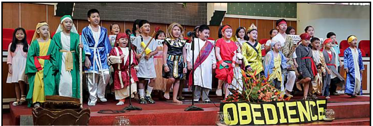
The Psalters took the stage last Sunday night and played the role of some Bible characters who showed obedience to God.

Third Quarter Focus : Bearing Fruit in Every Good Work