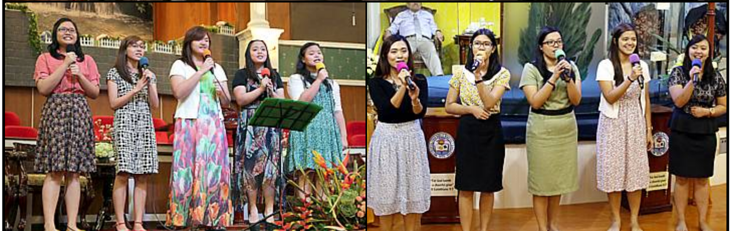
Top photo, the Pastoral Staff illustrate through their number the different gifts which help build up the work of God. Lower photos, the Young and Younger Ladies groups render their numbers, the former at Metropolitan BBE and the latter, during the services last Sunday night.

"Unto Him be glory in the church by Christ Jesus throughout all ages, world without end. Amen" (Eph. 3:21)