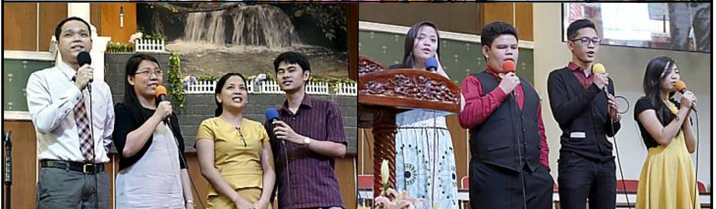
Top photo, the Lighthouse ALERT Team along with members of the Lighthouse BBC Pulilan pose for a picture after the medical mission. A total of 607 were serviced and 249 trusted Christ. Lower photos, quartet number of adults and YPs during services last Sunday night.

"Unto Him be glory in the church by Christ Jesus throughout all ages, world without end. Amen" (Eph. 3:21)