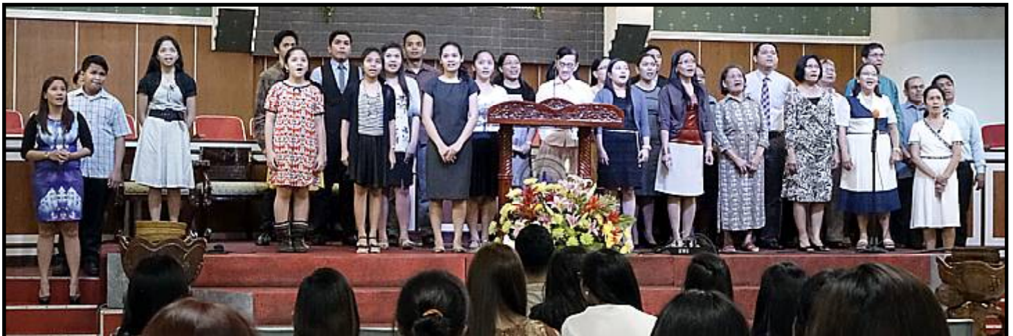
The Lighthouse District 3 makes a choral recitation encouraging everyone to take faithful part in the Step of Faith 2 Project.

As we enter the period within which we should be paying for the interests and